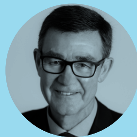
AIR CHIEF MARSHAL ANGUS HOUSTON AC, AFC (Ret'd)

Former Executive Director of the Law Society of the ACT.